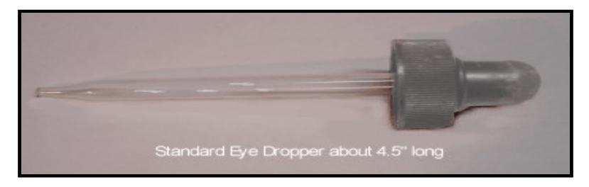
When using drops from a standard eye dropper always multiply the number of drops suggested in this book by 1.5.

In case the world has stopped using bottle dropper caps as shown below, the dropper opening in this cap is .180" X .180" square. The dropper opening of the standard eye dropper is round and .125" in diameter. All amounts of MMS given in the various recipes are approximate. For those who are more scientifically inclined, 17 drops from the bottle cap equals 1 milliliter (that's 1 cc). It takes about 25 drops from a standard eyedropper to equal 1 milliliter. Water does not weigh the same as MMS, so don't go astray with other measurements. MMS is 20% heavier than water and that changes the size of the drops and the number of drops in 1 millileter.